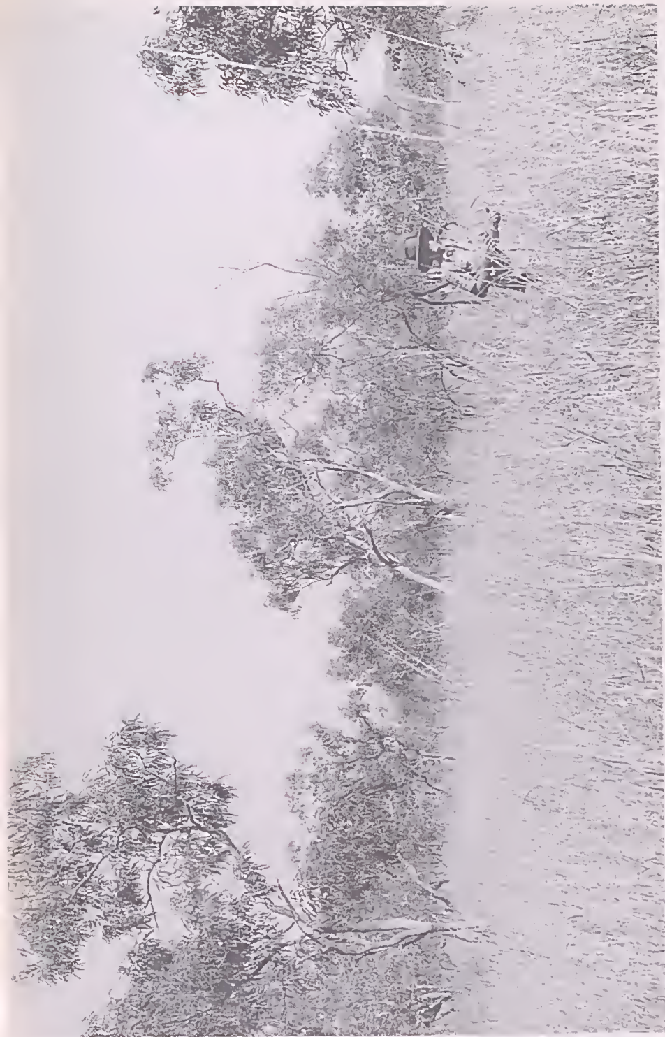
Figure 3. Eucalyptus tectifica sub-alliance dominated by E. tectifica , Sorghum stupeoideum , Dichanthum tenuiculmum and Chrysopogon latifolius , 3.5 km east of